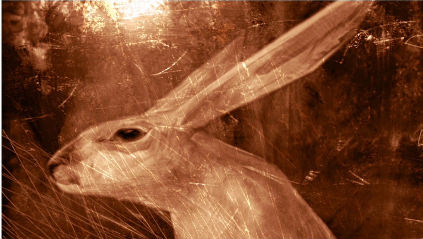
Prince with the swift warning