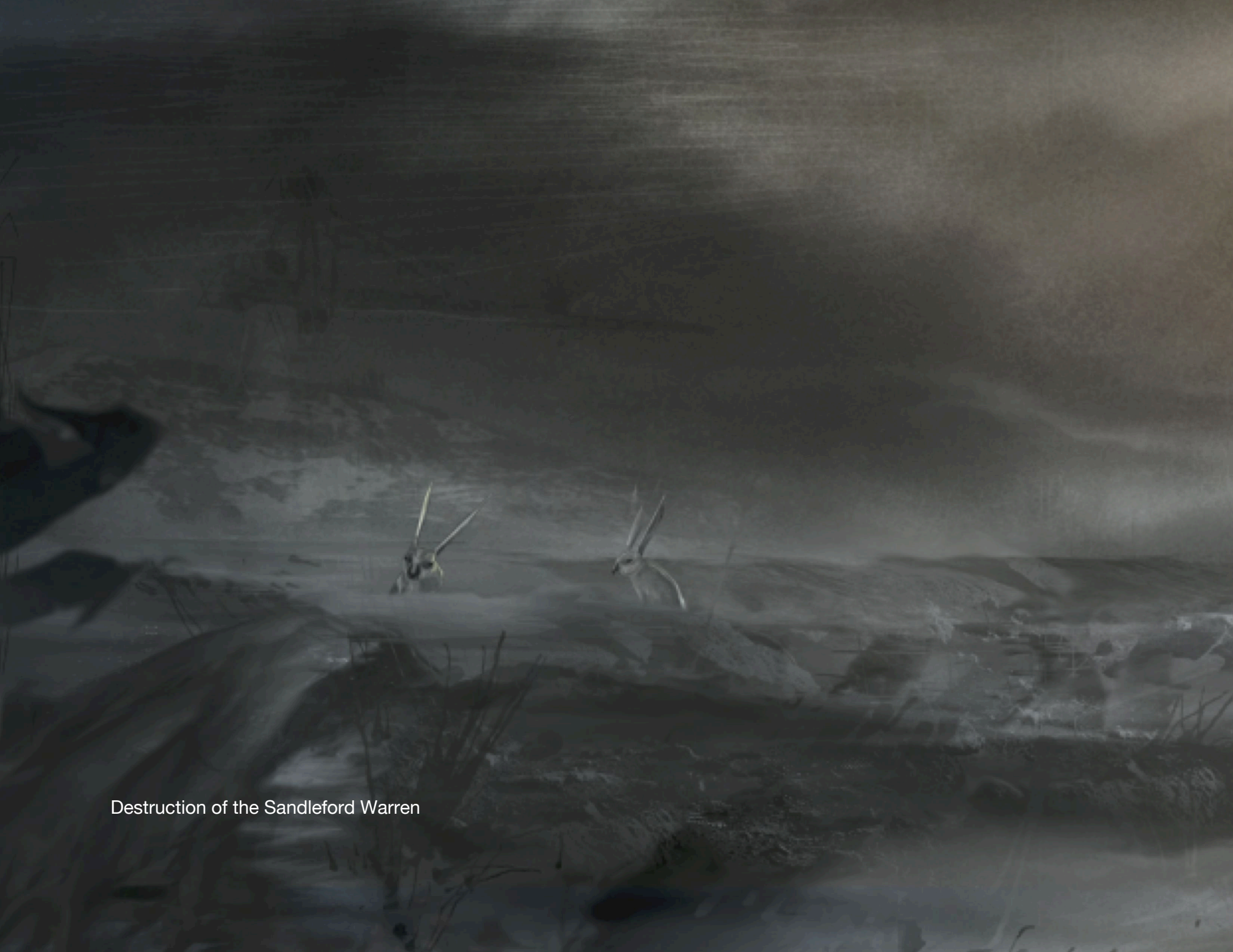
Destruction of the Sandleford Warren