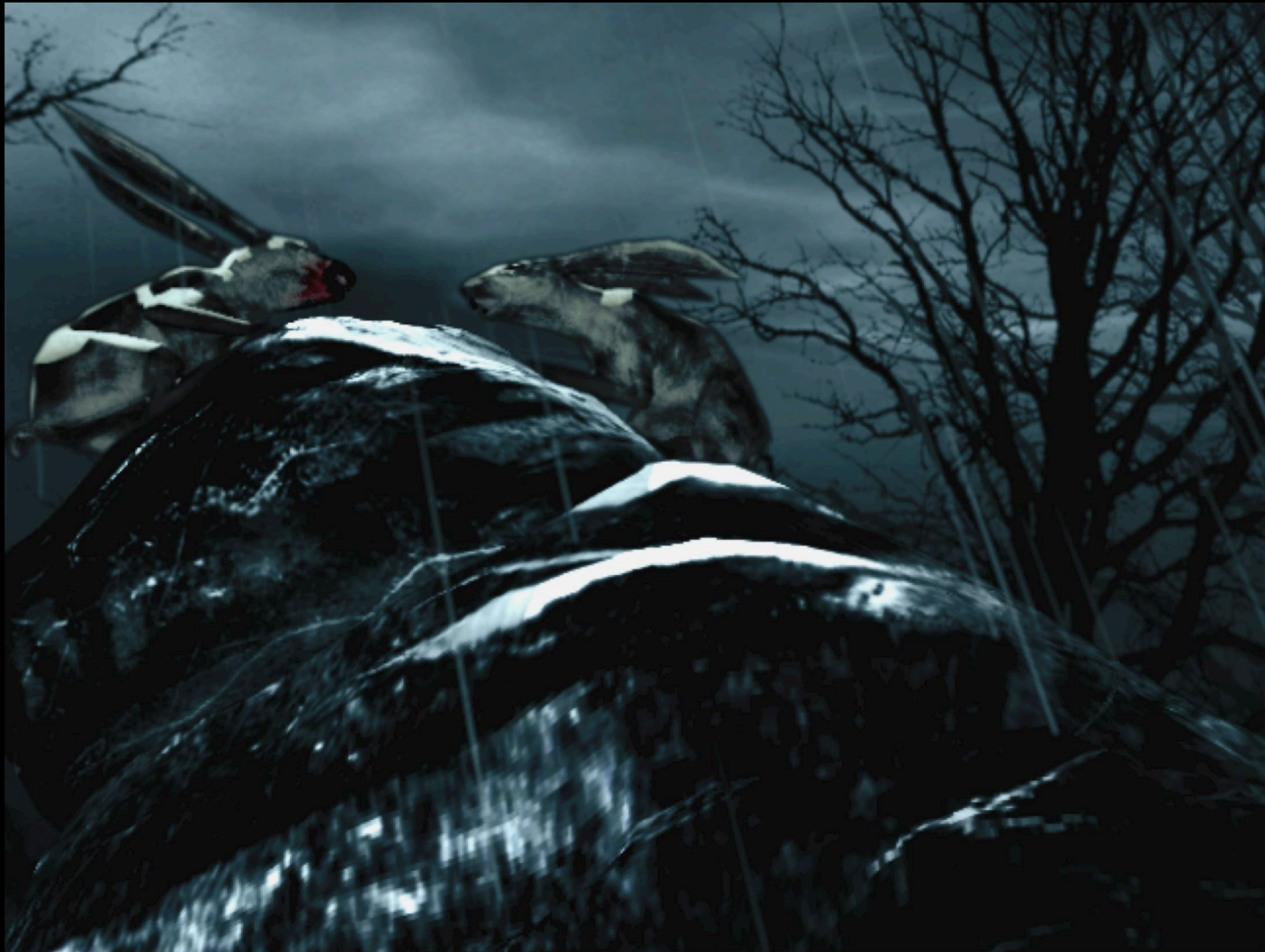
Battle at Efrafa