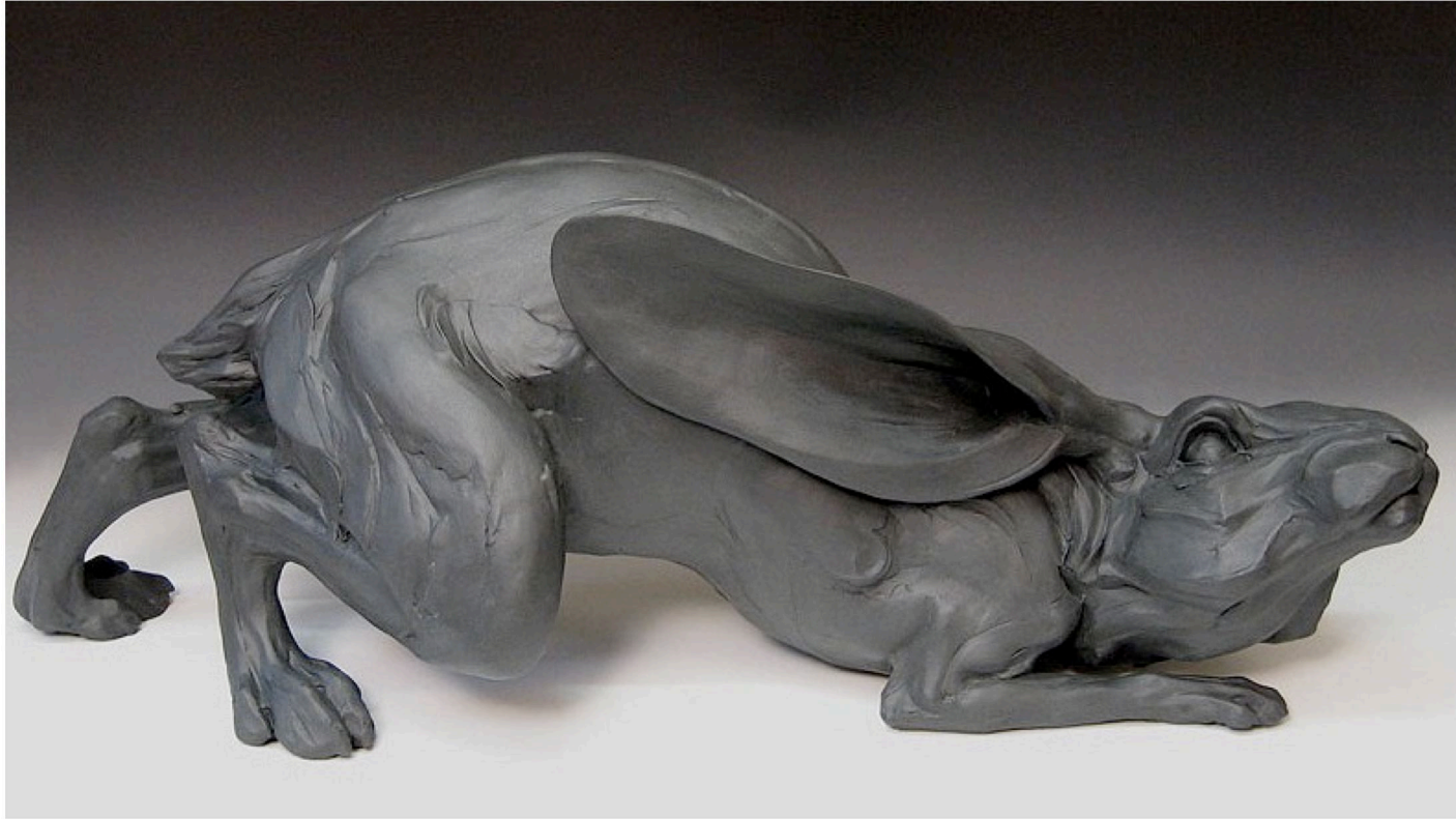
The Black Rabbit of Inle